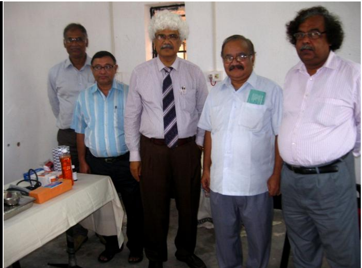
The University has celebrating its '14 th Foundation Day' in 1 st January 2016