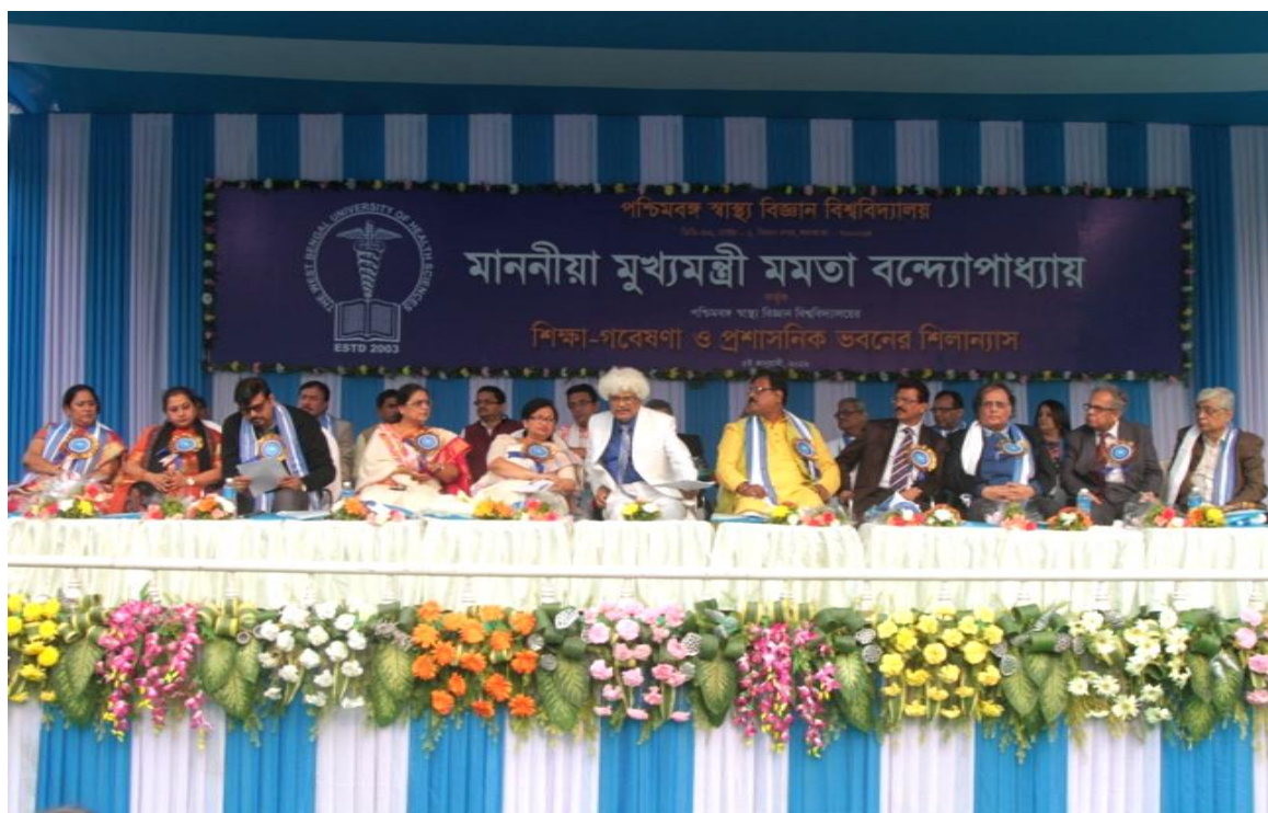
Foundation stone laying ceremony of Academic cum Administrative Building