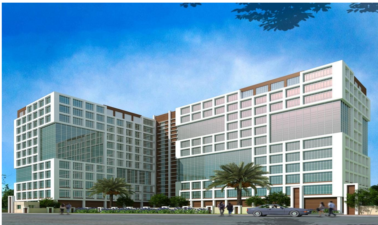
Proposed University Academic cum Administrative Building at Salt Lake Campus